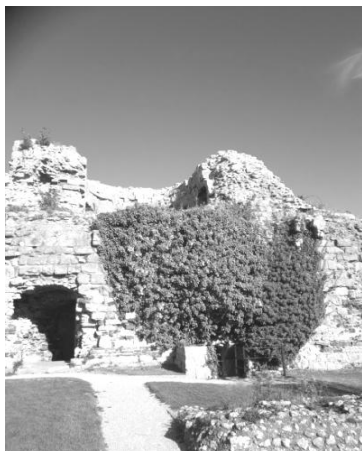
Inside Pevensey Castle

Following a tour of the inner castle ruins assisted by audio guides the party adjourned for a good lunch at the Priory Court Hotel nearby.