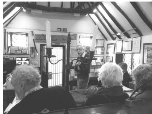
Inside Court House Museum